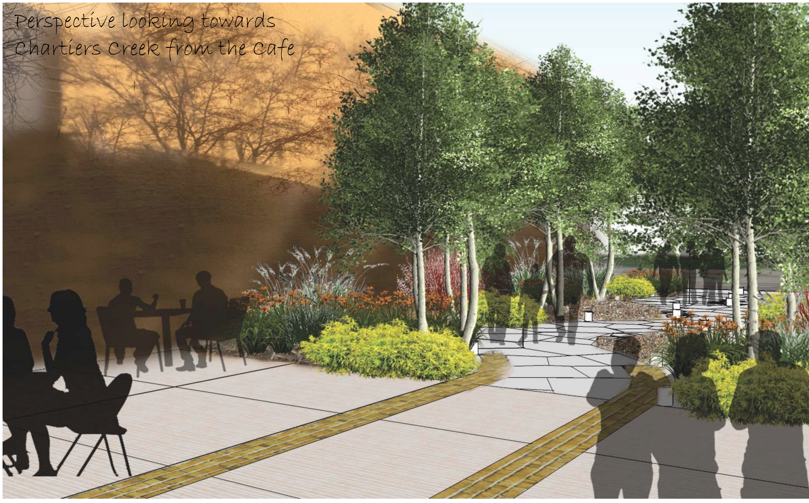
Perspective looking towards Chartiers Creek from the Café

Chartiers Avenue, the Main Street of McKees Rocks, parallels Chartiers Creek with the Furnace Street Extension and a parking area used for outdoor events separating the Avenue from the Creek. McKees Rocks Community Development Corporation (MRDC) has designated a vacant lot between First Niagara Bank and a Design Studio to serve as a connecting link between Chartiers Avenue and the outdoor events area. The concept for this project is to tie the two streets together, but also establish a connection to Chartiers Creek across the parking lot. The design uses a green façade on Chartiers Avenue to reference the structure that once occupied the site, with a rectilinear, concrete surfaced café area and overhead steel trusses to give an interior feel to the open air café. Concrete and steel were chosen based on industry in McKees Rock. The path then transitions into a deconstructed concrete path, mimicking the flow of a creek, with "erosion deposits" of pea gravel to serve as immersive spaces along the path. Plantings were chosen to give a riparian feel to the path, while also providing year-round visual interest. Trees are placed strategically to cast long shadows on the wall of the bank, an image inspired by a site visit in the late fall. LED spot lights on the opposite building continue to cast shadows in the evening.